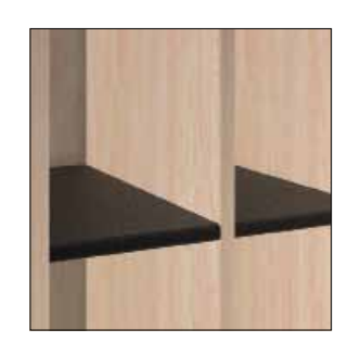
IRONCOAT surfacing is a polyurethane and polyurea coating that is applied to the front edge and the working surface.