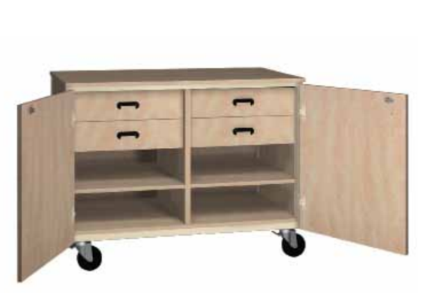
See Denali Mobile Series 4014-CL