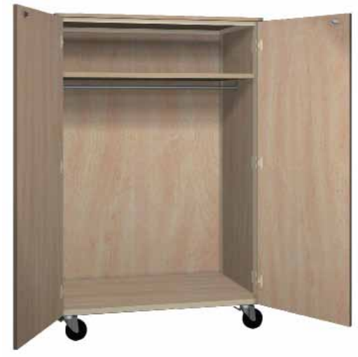
See Denali Mobile Series 4031-CL

You have practiced and rehearsed; now it is time for you to look and play your best. These storage cabinets provide plenty of space to keep your uniforms looking sharp.