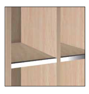
High Pressure Laminated panel with the front edge protected with a continuous piece of 3/4" x 3/4" x 1/8" extruded aluminum angle.