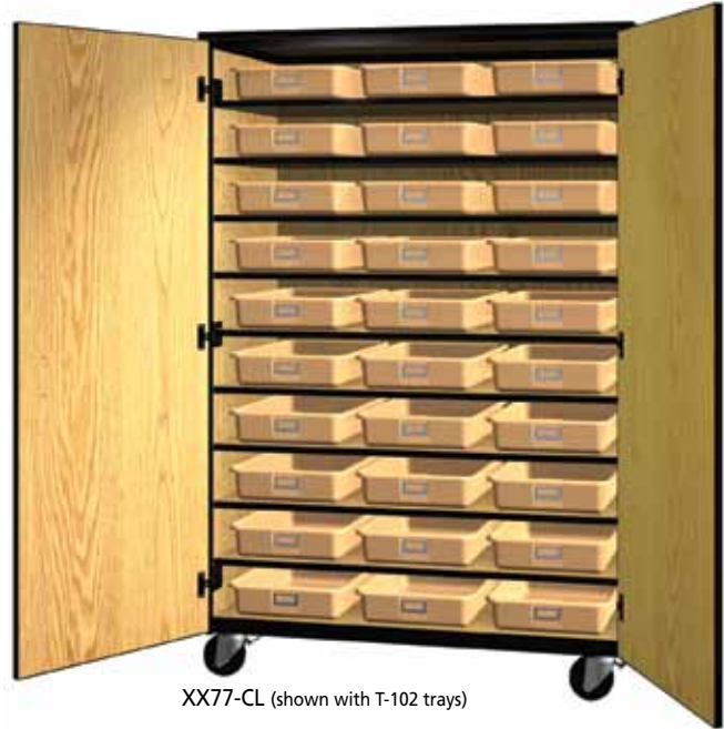
XX77-CL (shown with T-102 trays)