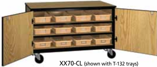
XX70-CL (shown with T-132 trays)

Totes keep people and projects organized. Whether for hats, gloves and important papers to go home for younger people, or for teaching or creating, these totes will organize all your items for class or individual projects.