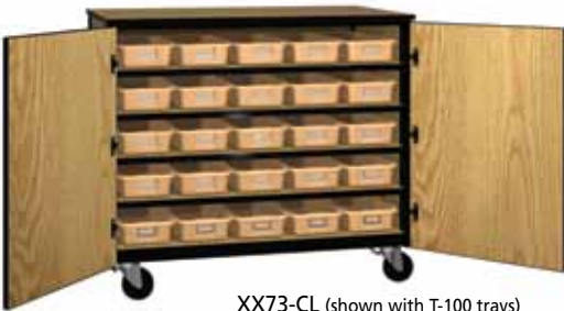
XX73-CL (shown with T-100 trays)